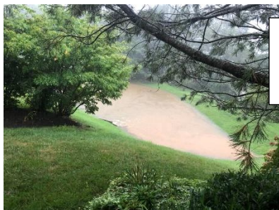
Sagamore retention basin to Darlington pond after August 2020 storm