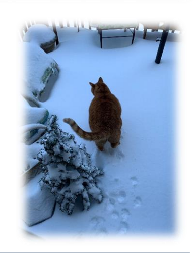
Sagamore Winter Snow! Wildlife! Lights! Fun!