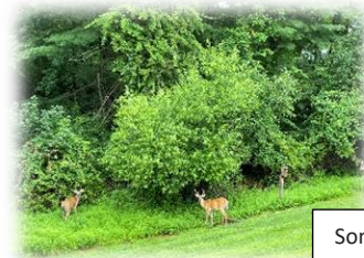
Some other neighbors!