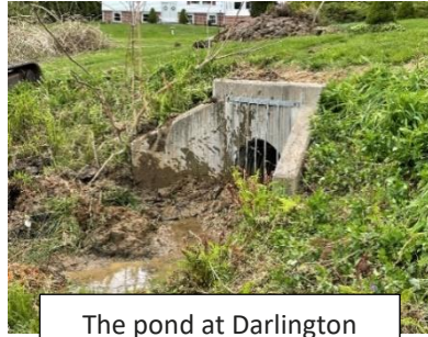
The pond at Darlington

Due to breaks in our storm water line that we were not aware of from our large retention basin to the Darlington Pond, mud / silt has found its way to that waterway. We are repairing the line in accordance with the Township regulations and with engineering oversight.